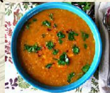
Red Lentil Soup