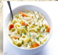
Chicken Rice Soup